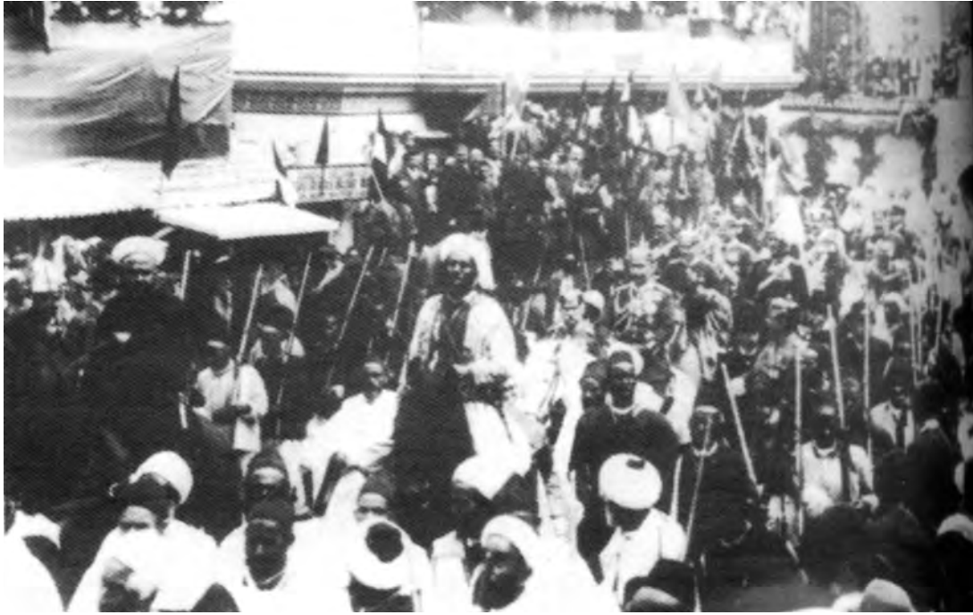
Kaiser Wilhelm's soldiers riding through the streets of Tangier in 1905.