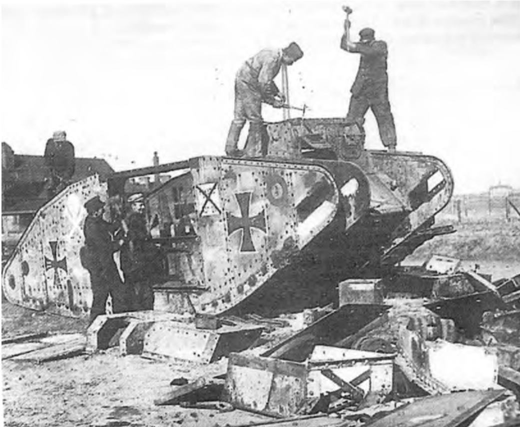
A German tank being dismantled in order to comply with the Treaty of Versailles.