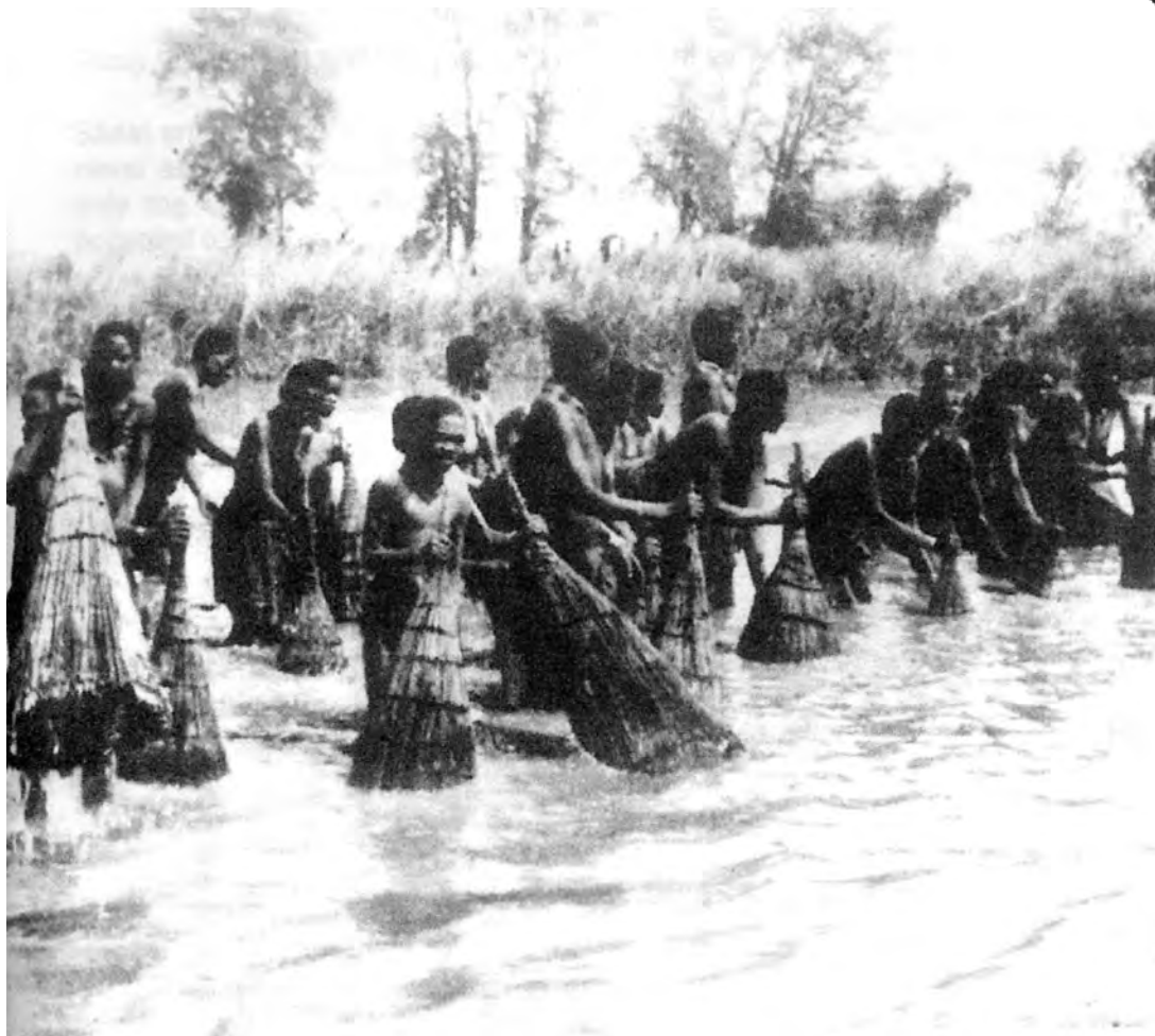
A photograph showing Namibians fishing. It was taken in the late-nineteenth century.

19 Study the photograph, and then answer the questions which follow.