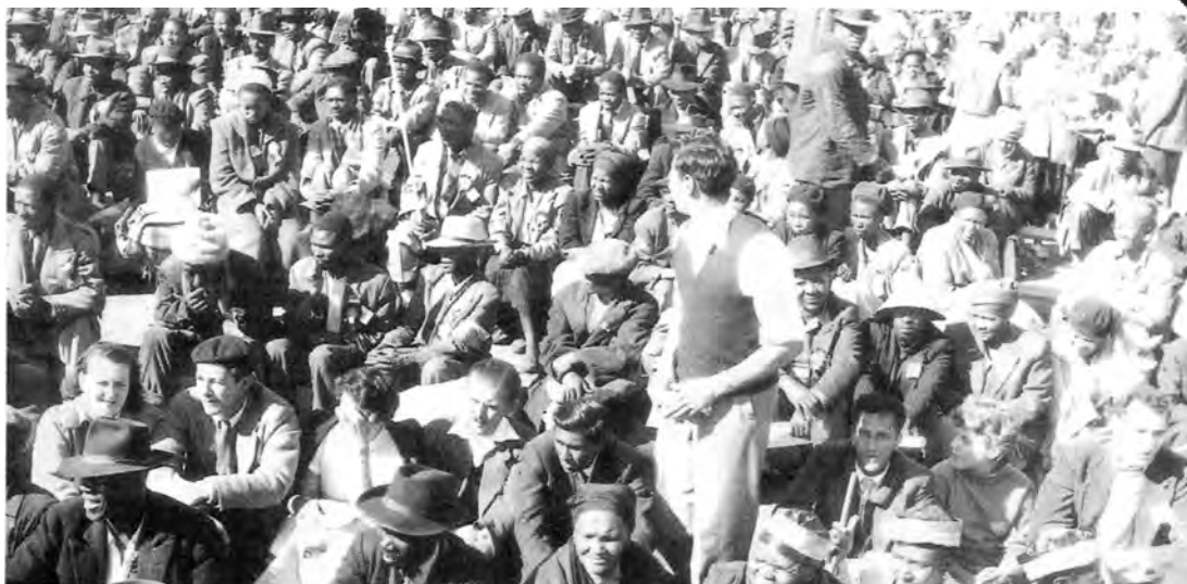
Some of the crowd at the Congress held at Kliptown, June 1955, when the Freedom Charter was signed.

18 Study the photograph, and then answer the questions which follow.