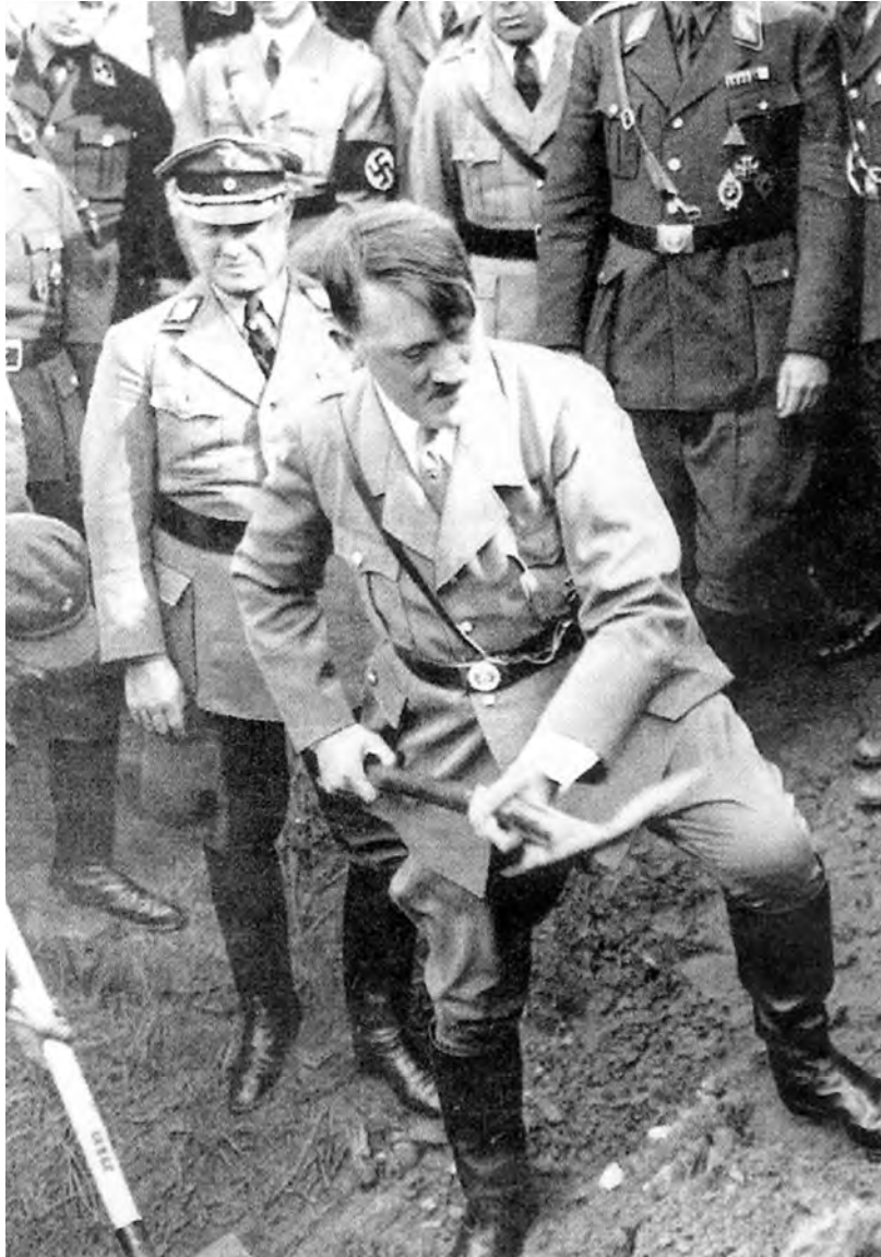
Hitler starts the construction of the first autobahn, 1933.

10 Study the photograph, and then answer the questions which follow.