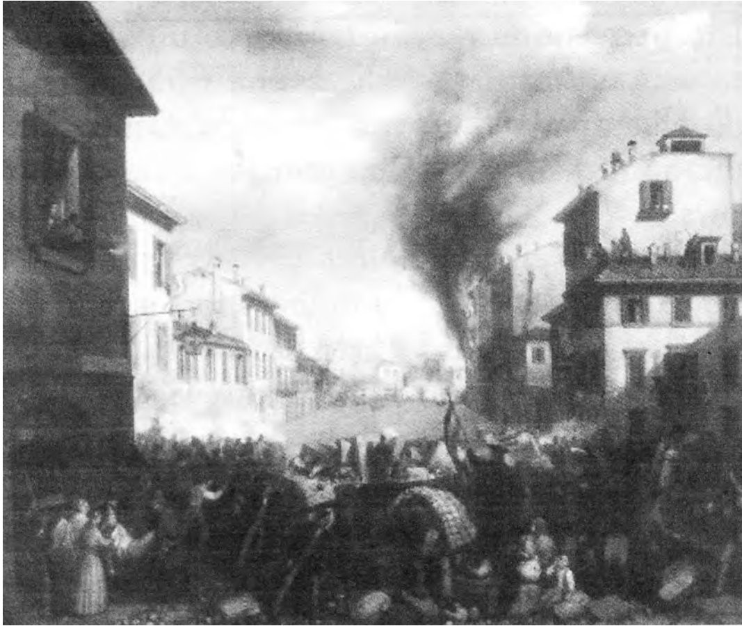
A street battle in the Milan uprising, March 1848.

2 Study the picture, and then answer the questions which follow.