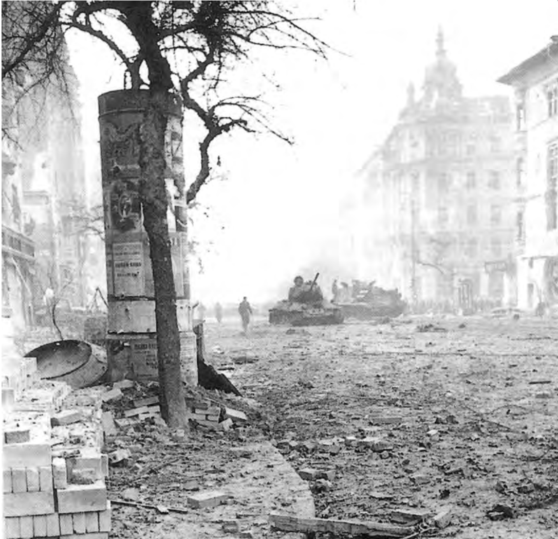
A street scene in Budapest, October 1956.