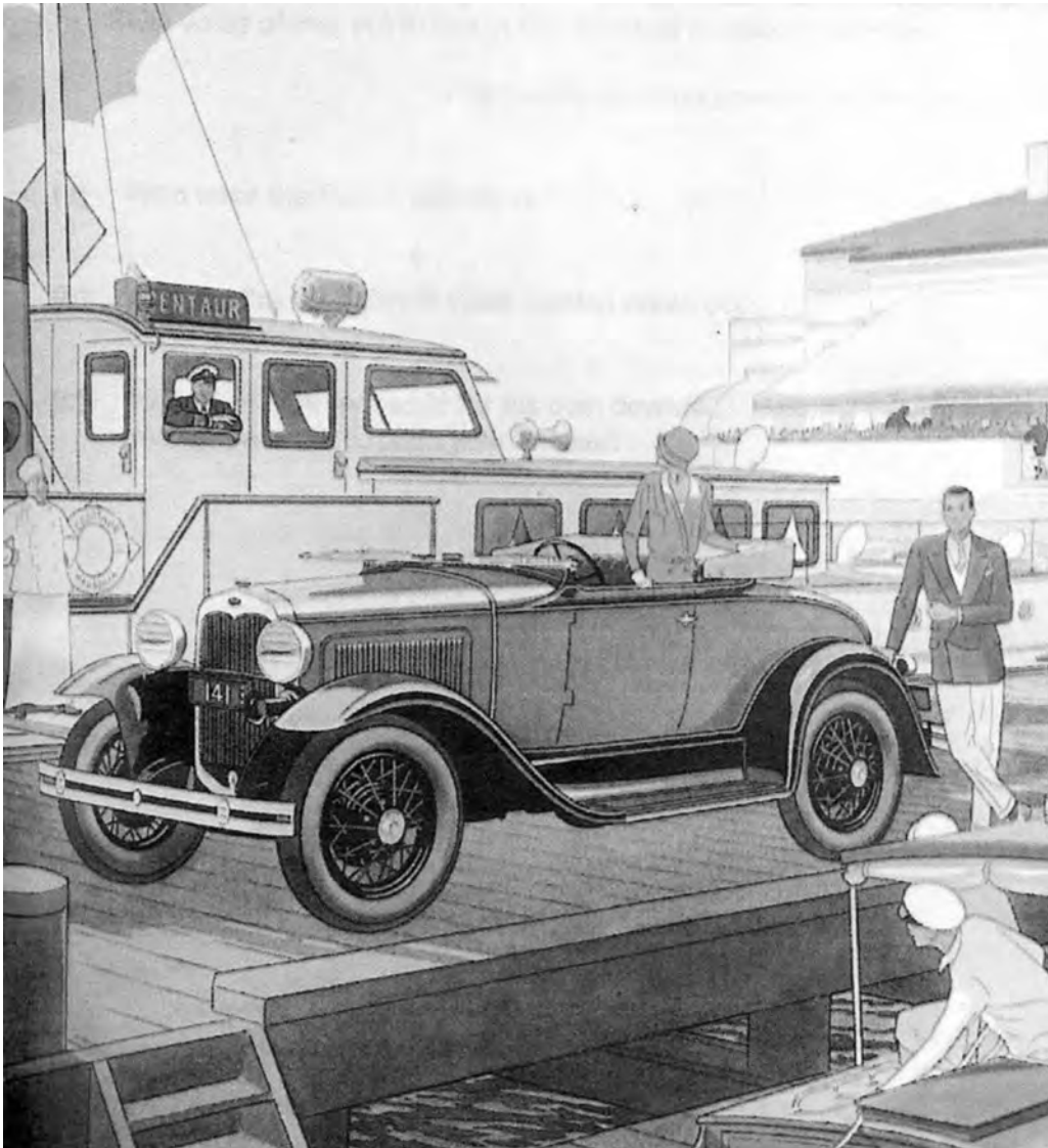
An advertisement from an American magazine for a new Ford motor car.

13 Study the advertisement, and then answer the questions which follow.