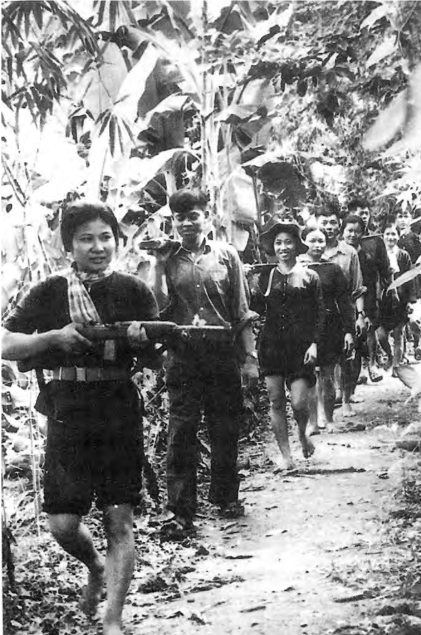
A Vietcong patrol in South Vietnam, 1966.